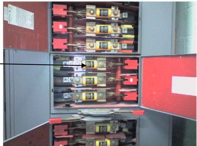
Image and Object Parameters Text Comments

Camera Model FLIR T360_ Western Image Date 5/2/2013 8:53:05 AM Image Name IR_0069.jpg Emissivity 0.95 Reflected apparent temperature 68.0 °F Object Distance 3.3 ft